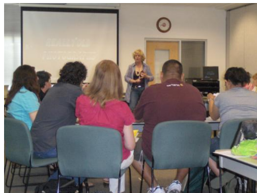
Teachers on Training Day