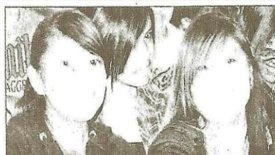
Students at Fort Thomas High School watch the Borderlands troupe perform skits.