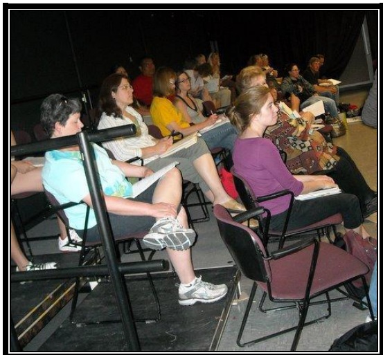
Teachers reviewing assessment issues with the project.

The following are just a few of the photos from the training session held at The University of Arizona Theatre Arts partnership.