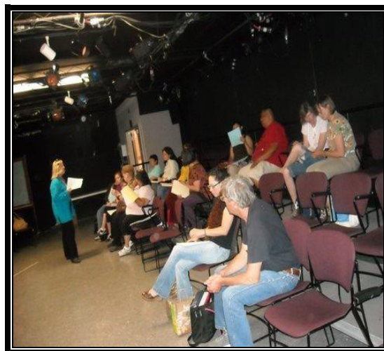
Teachers using the resources available in the Department of Language, Reading and Culture.