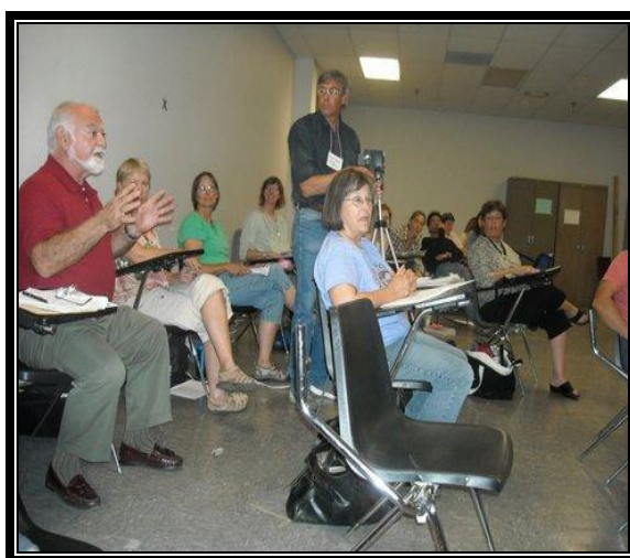
Teachers doing their presentations of arts integration learning at the U of A.